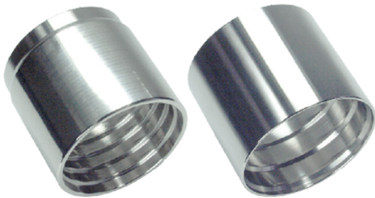
DN 31, 38, 51